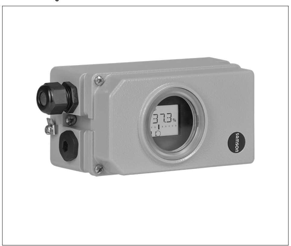
Type 3730-2 Electropneumatic Positioner